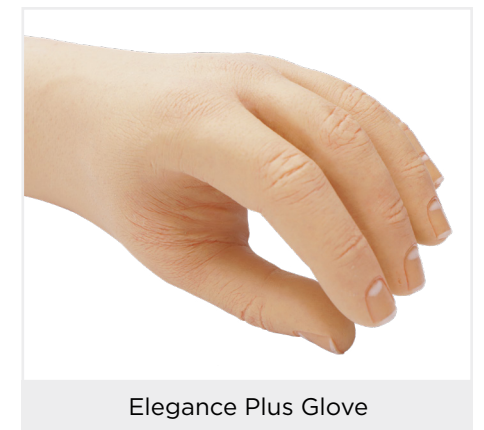
Elegance Plus Glove