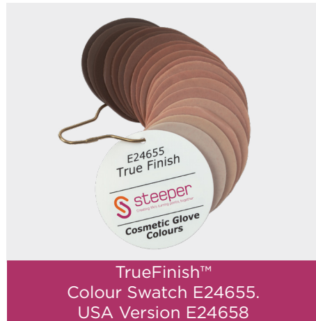
TrueFinish™ Colour Swatch E24655. USA Version E24658