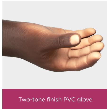
Two-tone finish PVC glove