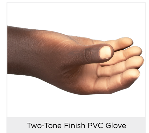
Two-Tone Finish PVC Glove