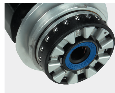
Quick Disconnect Wrist