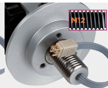
European Thread (M12 x 1.5mm)

For further wrist options please refer to the Steeper Upper Limb Catalogue.