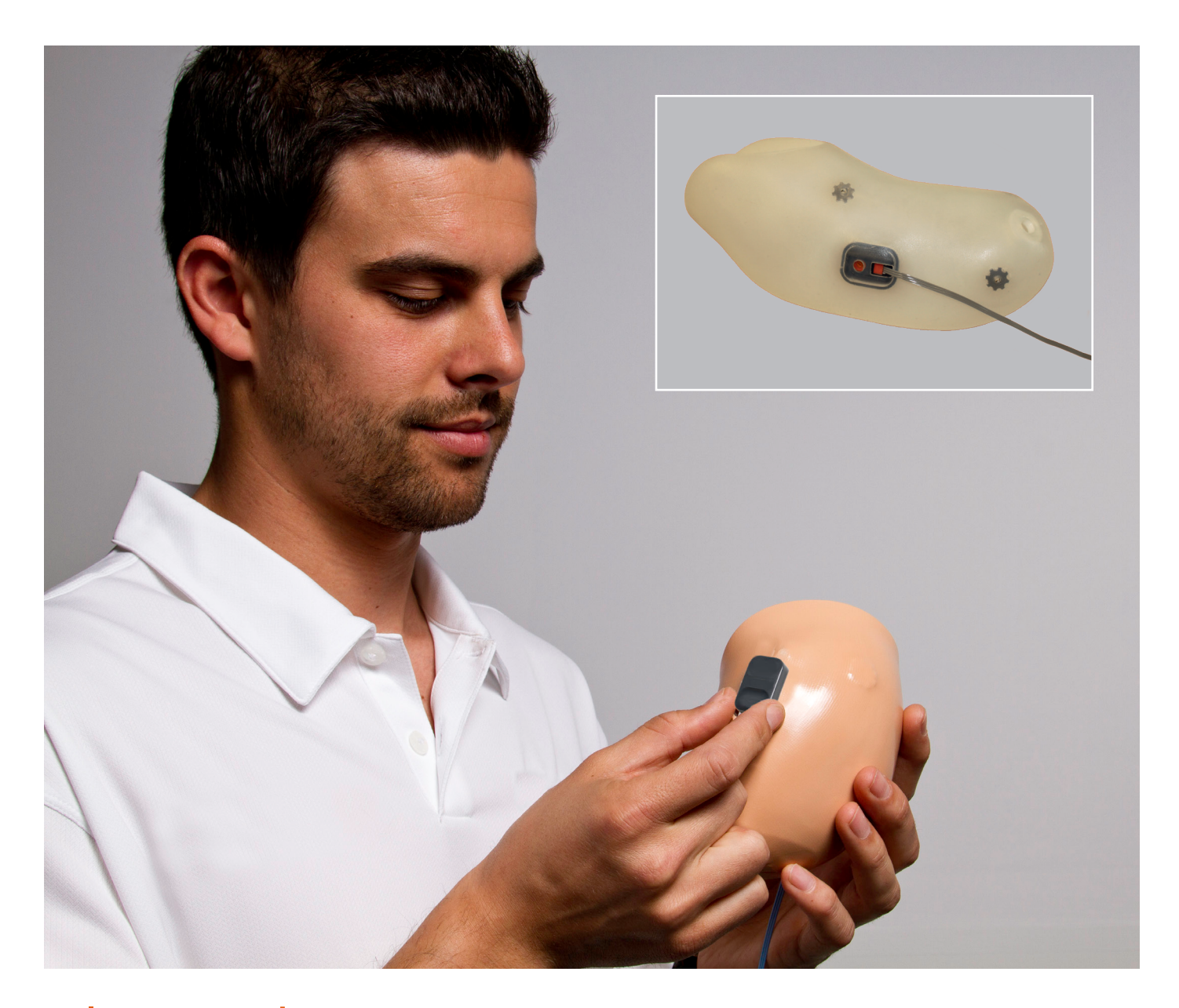
Electrodes & Seal-In Kit