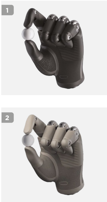
Pictured with a Quick Disconnect Wrist and Dusk faceplate.