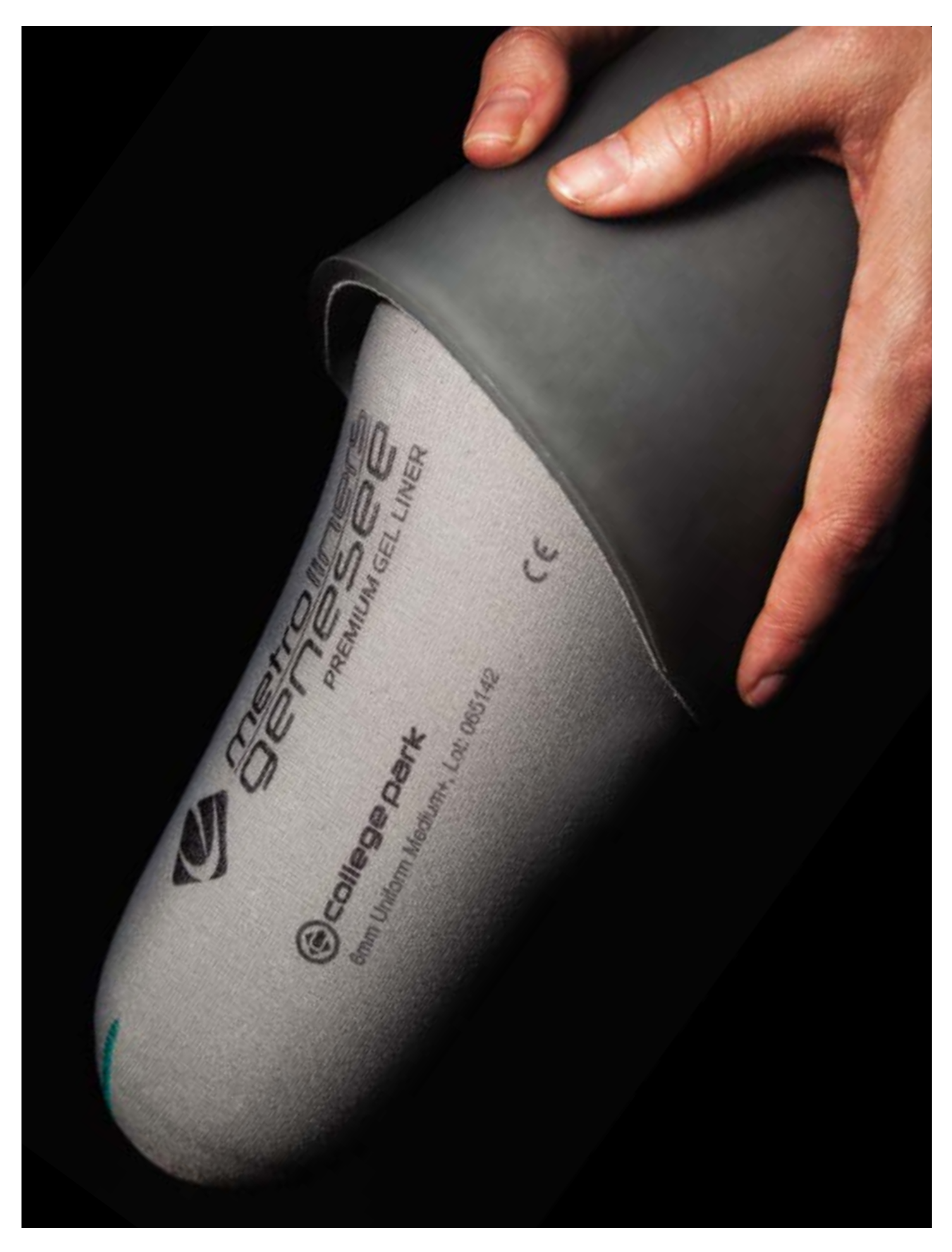
College Park Genesee, Odyssey & Sidekicks