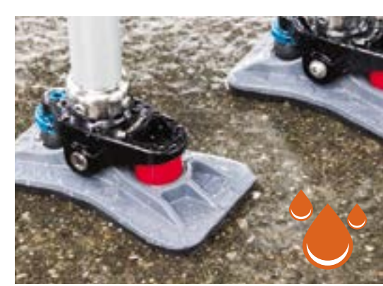
Water friendly - safe for use in the shower

Note: All alternative bumpers and tools are supplied with the Sidekicks.