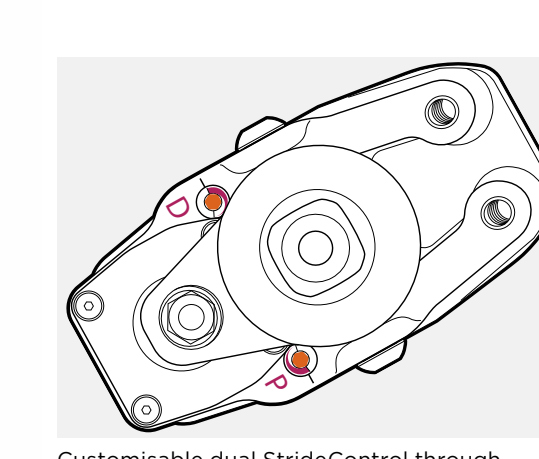
Customisable dual StrideControl through independently adjustable plantar and dorsiflexion valves for in-clinic tuning