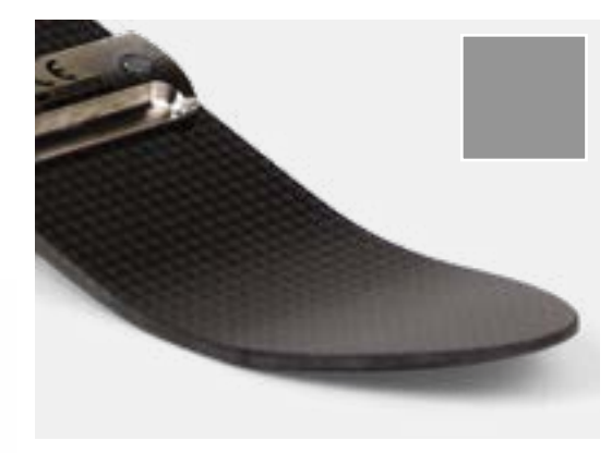
Carbon fibre foot base