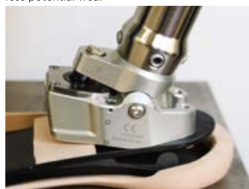
12 degrees of smooth hydraulic motion