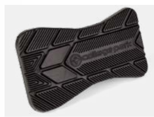
Moulded tread provides traction and added durability