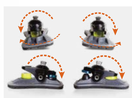
Sidekicks mimic anatomical ankle rotation to allow for movement to occur naturally; reducing socket forces and eliminating unwanted torque