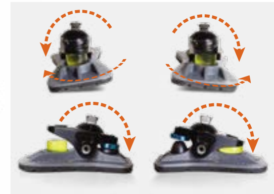
Sidekicks mimic anatomical ankle rotation to allow for movement to occur naturally; reducing socket forces and eliminating unwanted torque