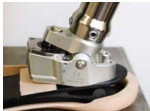
12 degrees of smooth hydraulic motion