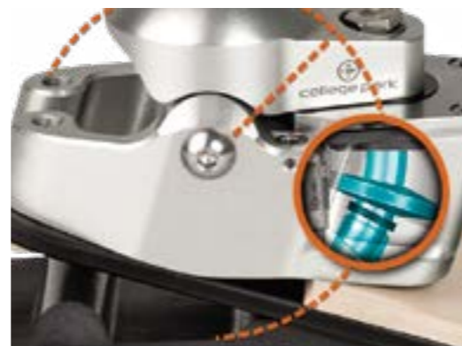
One pivot point for smooth gait cycle and longer life span - fewer moving parts result in less potential wear