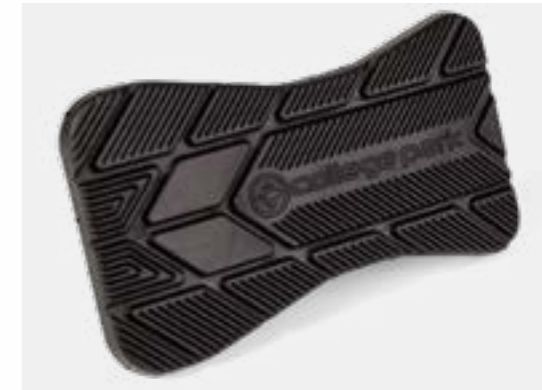
Moulded tread provides traction and added durability