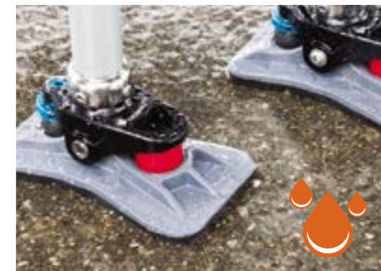
Water friendly - safe for use in the shower