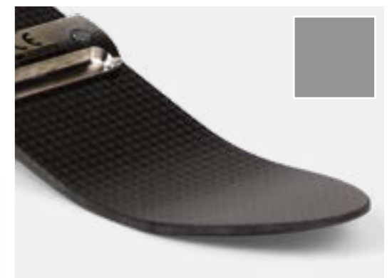
Carbon fibre foot base