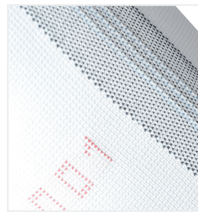
Improved Knit Technology