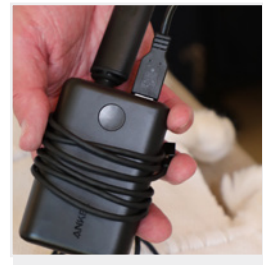
Battery Booster Kit