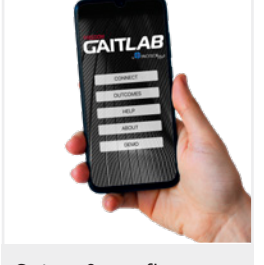
Setup & configure using dedicated apps