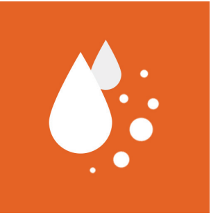
Water resistant - safe for contact with water and submersion*