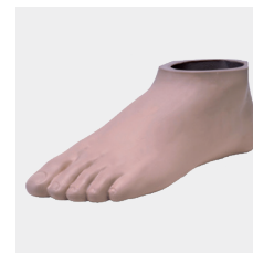
Mid profile foot shell