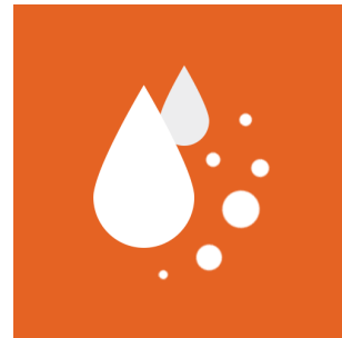
Water resistant - safe for contact with water and submersion*