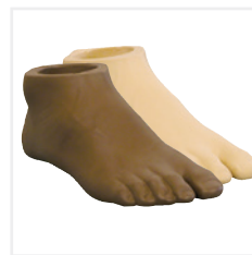
Light/dark Sandal toe foot shell