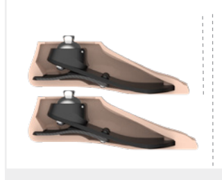
Unique size-up foot shell that allows the user to adjust to a larger size without needing a new foot

Stack growth plates to accommodate 19.5mm of limb growth