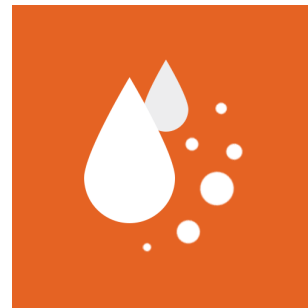
Water resistant - safe for contact with water and submersion*