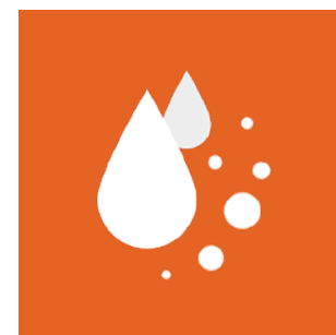
Water resistant - safe for contact with water and submersion*

*Water note: The Kinnex should not be immersed in salt water or chlorinated water - following exposure to salt water or chlorinated water, immediately rinse with fresh water and dry.