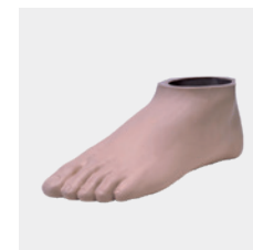
Includes foot shell, available in three skin tones