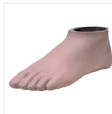
Mid profile foot shell