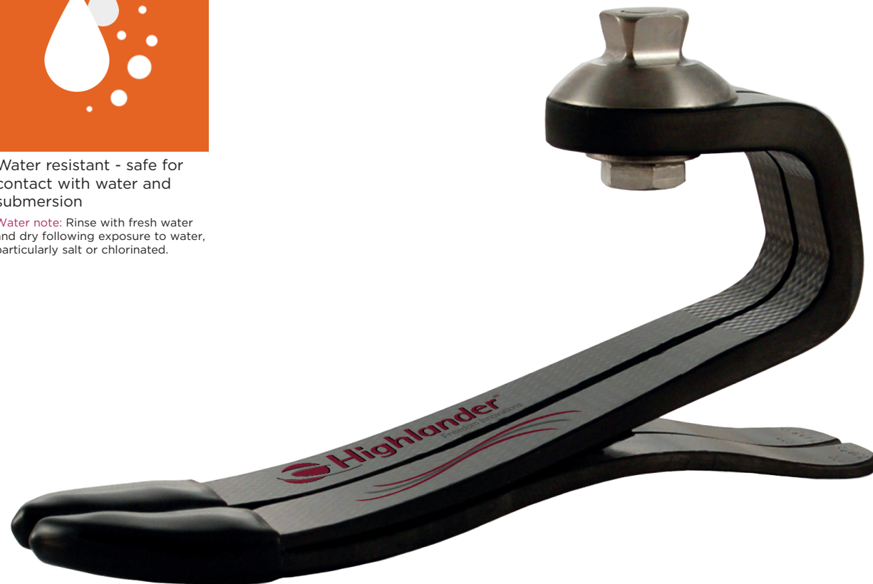
Sandal toe: sizes 22-28 only