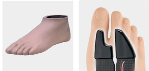
Mid profile foot shell Sandal toe: sizes 22-28 only