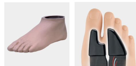
Mid profile foot shell