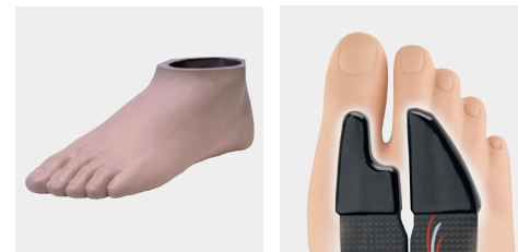
Mid profile foot shell