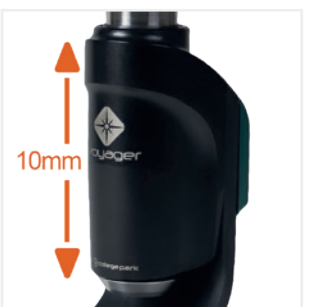
Vertical shock unit