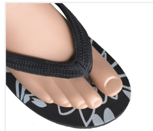
Removable foot shell with sandal toe