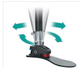
Transverse rotation inversion-eversion