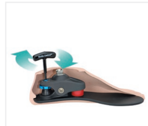
Stride Control™ adjuster