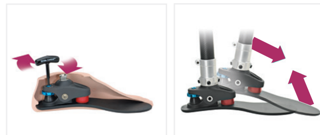
Stride Control™ adjuster