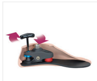
Stride Control™ adjuster