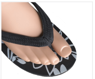
Removable foot shell with sandal toe

Note: Please see the following page for Tribute spare parts ordering information.