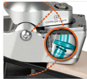
One pivot angle