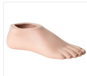
Solid toe foot shell