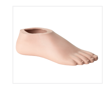
Solid toe foot shell