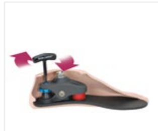
Stride Control™ adjuster