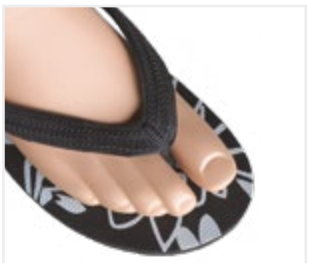
Removable foot shell with sandal toe

Note: Please see the following page for Tribute spare parts ordering information.