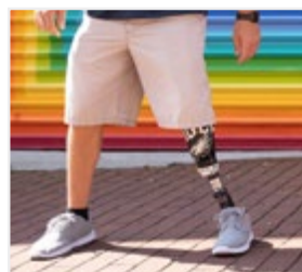
Split-keel and heel for increased inversion/eversion