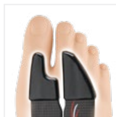
Sandal toe: sizes 23-28cm only