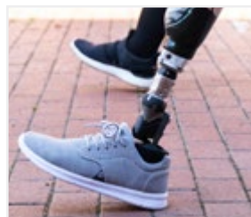
Spherical Shock Unit (SSU)