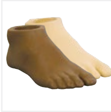
Light/dark Sandal toe foot shell