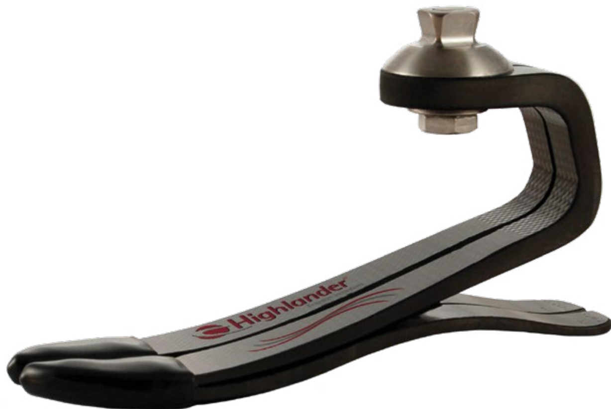
Sandal toe: sizes 26-28cm only