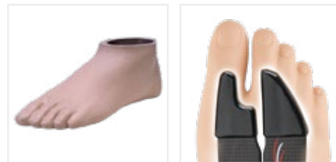
Mid profile foot shell