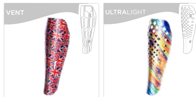
VENT Designed with the 'super hero' in mind with vented and raised sections.