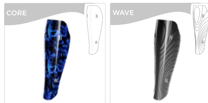
CORE An elegant smooth design which gives an excellent leg/calf shape under trousers, leggings or long boots.