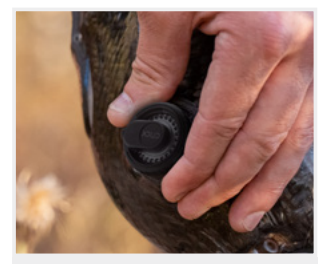
Click Reel offers up to 7:1 mechanical advantage.