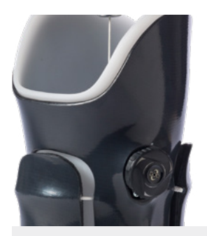
Familiar BOA Dial System