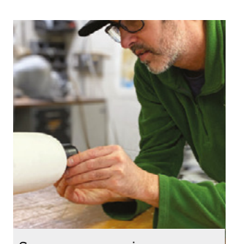
Secure suspension regardless of limb position