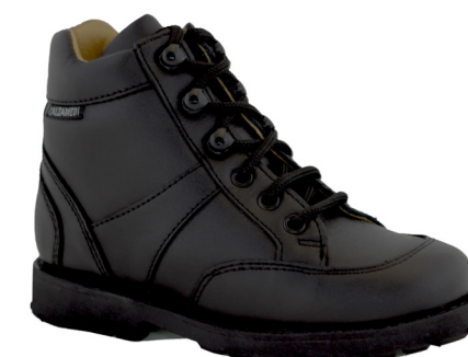
Black Leather - Lace Code: 4200-0101