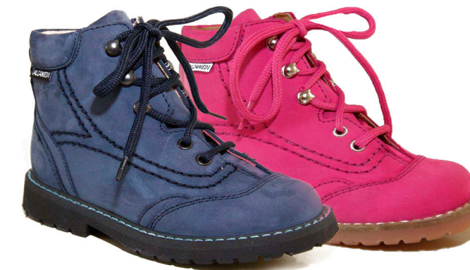
Blue Nubuck Lace: 4202-0202 Hook and loop: 4203-0202