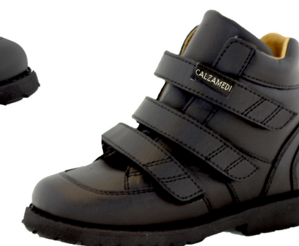
Black Leather - Hook and loop Code: 4201-0101

All styles are supplied with removable anatomically-shaped footbeds.