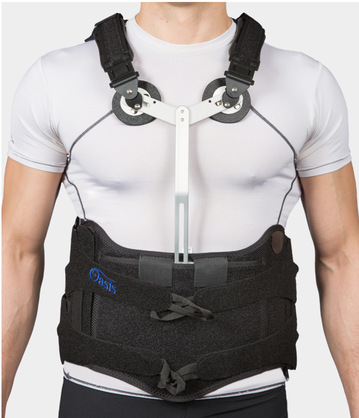
Model wearing PPK version shown above.