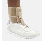
Foot-Up shown with footwear