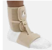
Foot-Up shown with shoeless wrap