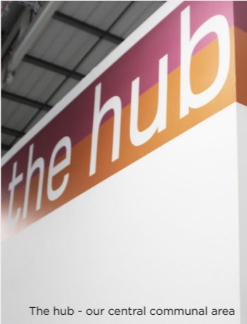
The hub - our central communal area